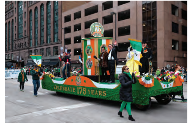
2017 Parade float of the Irish American Club East Side