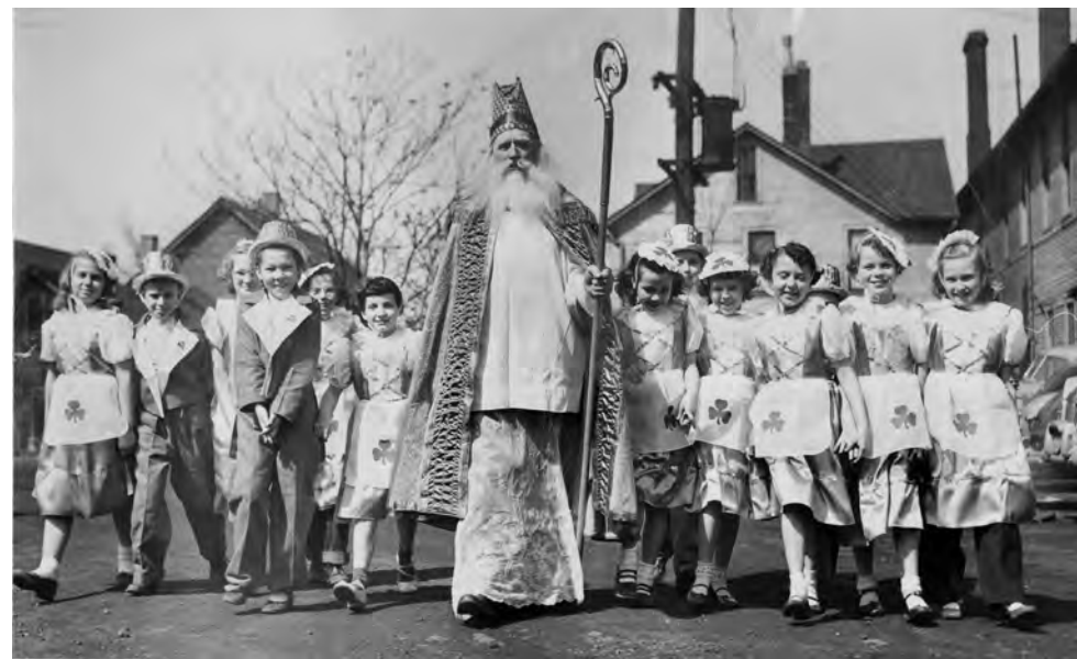
Can anyone identify any of the children from St. Patrick's on Bridge in this 1954 Parade photo? Send identifications to iaasadmin@gmail.com .