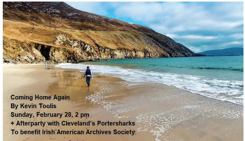
“Coming Home Again,” a filmed reflection on the bonds of immigration linking Cleveland and Ireland, formed the centerpiece for a virtual fundraising event that took the place of the traditional Walks of Life dinner in February 2021.